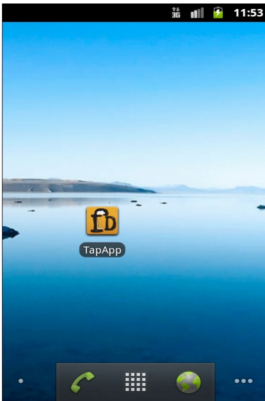
Custom Launcher Icon

The framework for your app is very flexible. This allows us to highly customize your app to your brand. Colors, logos and layout can all be customized to make your app truly unique while properly displaying the brand image you've worked hard at creating. If you're looking for some assistance with branding, our marketing and graphic staff is ready and able to work with you in creating images, color schemes and layouts. On top of that you are able to enter in all names, descriptions and details for your beers and can be changed as frequently or infrequently as you choose.